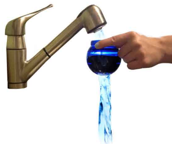
Straps included for secure attachment to virtually any faucet